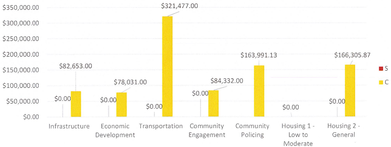
ACTIVITIES SUMMARY ($)